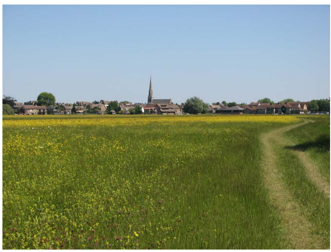
Hemingford Grey Meadow in flower, looking towards St Ives.

The Meadow was always a popular place for walking and courting and for skating when it froze after floods and people told me of the flowers including "Cuckoos" (Cardamine pratensis) and Tom Thumbs (Lathyrus pratensis or Lotus sp) and the birds, especially the numerous skylarks. It was used as a racecourse for a few years in the late 18th century and in the early days of flying as an informal airfield. For the wedding of the Prince of Wales in March 1873 and the gaining of borough status for St Ives in November 1874 there were sports on the Meadow and a huge bonfire which left signs of damage for several years afterwards. And the memory of a villager explained that what looked like drainage channels were in fact ditches dug in 1940 to prevent enemy planes from landing! The latest large event was the Inland Waterways Festival in August 2007 which caused some damage as only days beforehand the meadow had suffered a summer flood. The last hay was not cut until September that year.