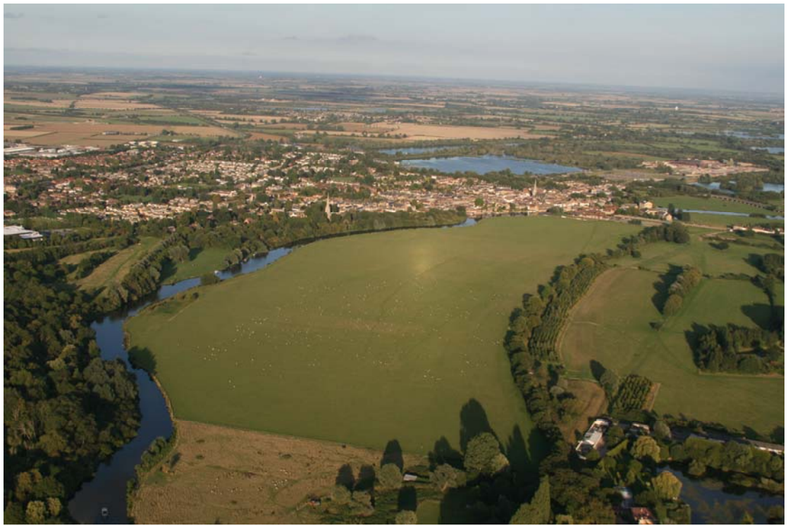
Aerial photograph of Hemingford Grey Meadow

I have lived in the village of Hemingford Grey near the River Great Ouse since 1976 and, like many others, walked the 1½ km into St Ives by the ancient right of way across the 50 hectare meadow. Then one day someone asked me why the cattle were being allowed to eat the wild flowers! This question made me realise that local people both loved the Meadow but knew nothing about its history or how it was managed.