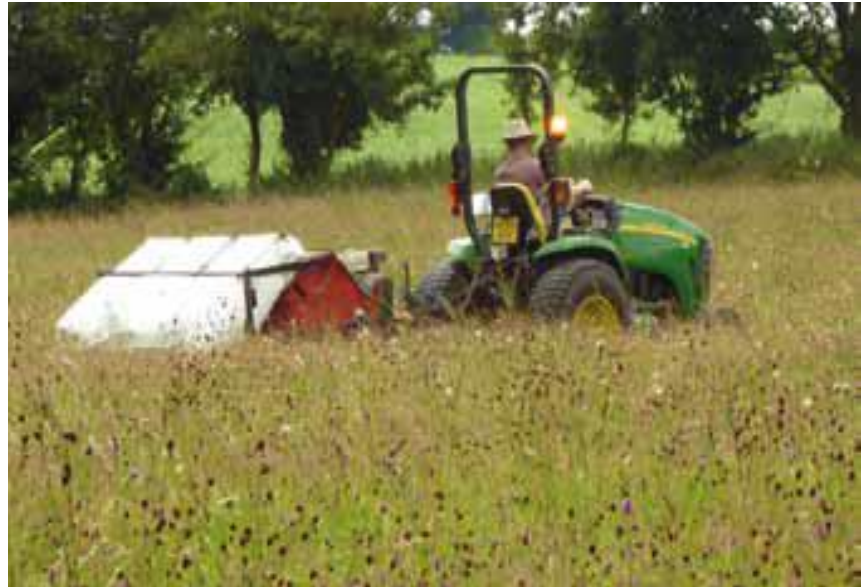
Seed harvesting at Boddington Meadow using a brush harvester.

Boddington Meadow is a 2.3 ha Wildlife Trust for Bedfordshire, Cambridgeshire and Northamptonshire reserve and Local Wildlife Site with areas of Burnet floodplain meadow (MG4). The site is particularly herb-rich and also has a good range of grasses. Never ploughed, a wet meadow on the edge of a reservoir provides an impressive display of colour, with great burnet, betony and devil's-bit scabious. The site became a Trust reserve in 1986 and has been managed through a late hay cut and light aftermath grazing ever since. It became the county's Coronation Meadows in 2013.