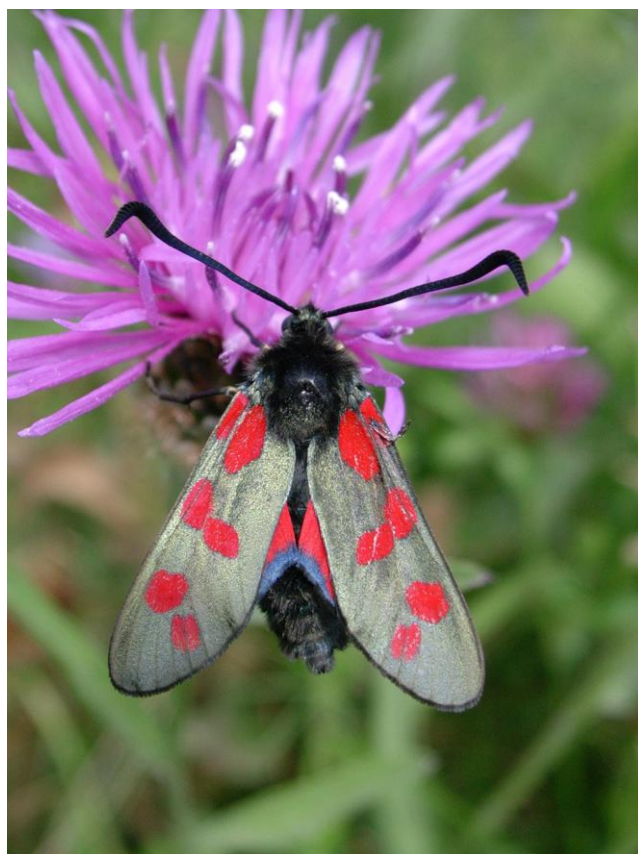
Six-spotted burnet moth on common knapweed

For more information see Technical Information Notes TIN061 - Sward enhancement: selection of suitable sites and TIN062 - Sward enhancement: choice of methods .